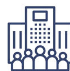
Government & Commercial