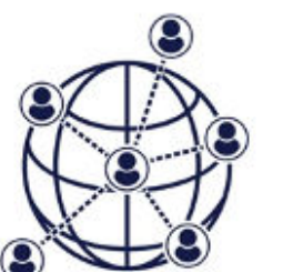
Solution & Service Providers